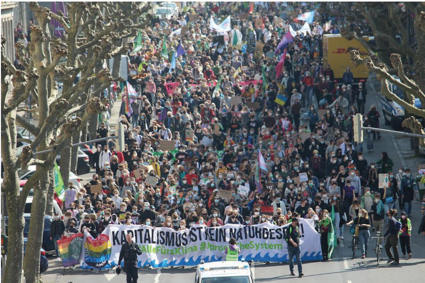
Figure 1: a picture conveying a sense of scale of a FFF protest

ments, are significant visual events for the climate initiative. In other words, they play an important role for the activism of FFF. Research has shown that these mass demonstrations have a pronounced impact on the attention of the general public on the issue of climate change (Sisco et al. 2021). For instance, seeking information about climate change on the internet has increased significantly since 2019, when global mass protests reached their peak. These mass protests, hence, draw enormous attention to the issue of climate change. Even though the heightened attention seems to be short-lived, the mass rallies generate a global awareness comparable to international political events such as the United Nations Climate Change Conferences (ibid. 5–6). Images arguably help to convey a sense of scale of these climate protests.