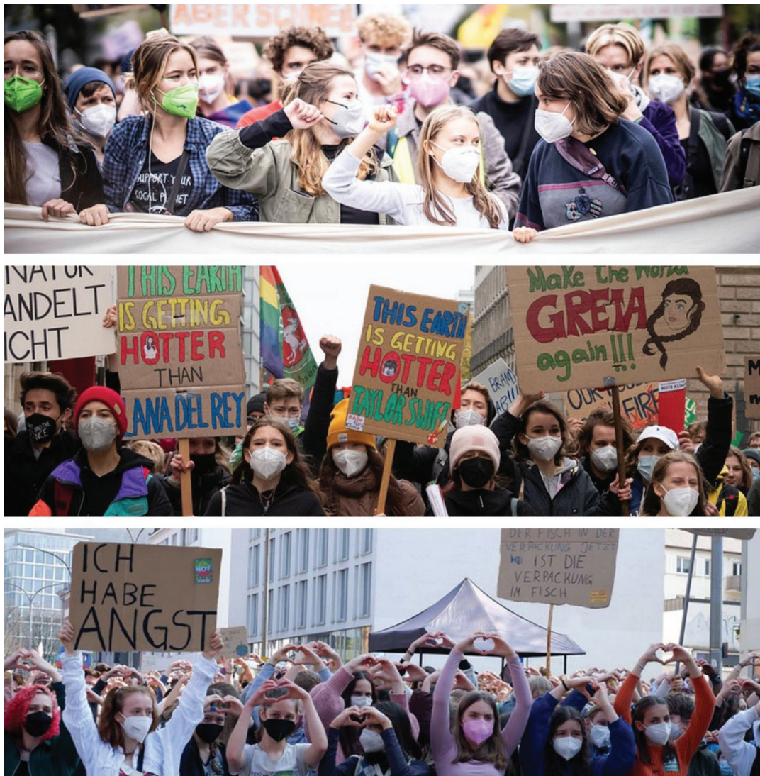
Figure 3: generic pictures highlighting white, female youth agency (sources: top , middle and bottom ); collage made by the author; © Fridays for Future Deutschland

2022). 2 Arguably the most famous example of rendering non-white climate agency invisible is Ugandan activist Vanessa Nakate, who was cropped from a press photo with other well-known, albeit white, female protestors. Standing next to, among others, Greta Thunberg and Luisa Neubauer, who attended the 2020 World Economic Forum, Nakate, as the only non-white and non-European, was left out by the Associated Press (AP). Later AP apologized to Nakate and republished the original photo. Another example is Tonny Nowshin, a Black, indigenous and people of colour (BIPOC) activist, who, six months after Nakate, was excluded from pictures shared on social media by Greenpeace Germany (Nowshin 2020). Nowshin stated that she was visible in plenty of protest pictures. However, none of the photos featuring her were chosen for publication. Only pictures featuring her fellow female protestors, all white and some of them from the FFF movement, were circulated.