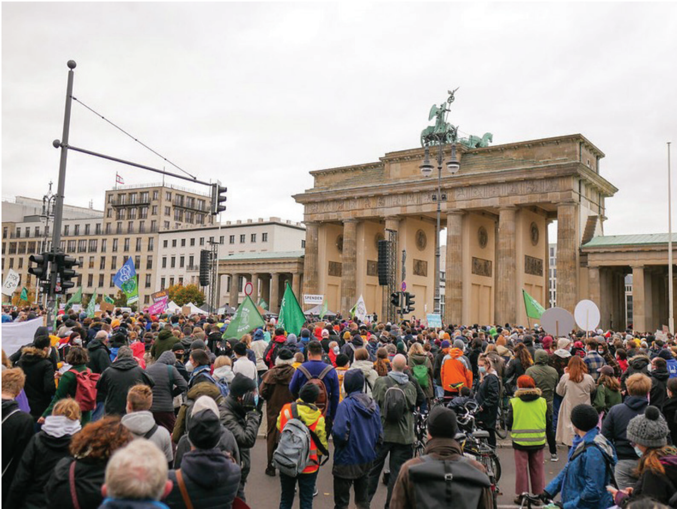
Figure 2: protest taking place in urban space

(Sezer 2020). Thus, the visibility of specific groups in public space is also a political issue.