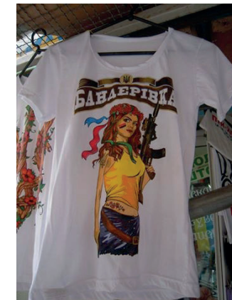
Fig. 2 (left): T-shirt on sale in Ukraine, autumn 2014.

is to lead, control, and protect; woman's is to ensure the nation's reproduction, physically and symbolically. Beyond this re-traditionalization of gender hierarchies, however, '[a] nother important phenomenon to track is the way women in the national and volunteer armed forces in Ukraine have been sexualized in images circulating in the press and social media'. 7 A T-shirt currently available in Ukraine (Fig. 2) features a woman with long red hair dressed in tightly fitting clothes and carrying a machine-gun. On the woman's right hip a nationalist-style tattoo is visible and on her cheek is a painting of the red-and-black UPA flag. This banderivka combines battle-hungriness and combat-readiness with what are clearly deemed to be quintessentially Ukrainian good looks.