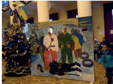
Fig. 1: Poster 'Revolutionary Commandant of the Kyiv City Council', Kiev City State Administration building, 2 January 2014.

the OUN and UPA featured prominently in the Maidan protests, where ordinary men had a chance to live out these fantasies of heroic masculinity. One remarkable illustration of the way in which the Cossack and OUN/UPA strands came together symbolically, visually, and transhistorically was a large free-standing poster which was used as a backdrop for souvenir photos (Fig. 1). Positioned inside the Kiev City State Administration building, it depicted a Cossack and a UPA fighter standing shoulder to shoulder over the foe they have just vanquished – a member of the 'Berkut' special police force.