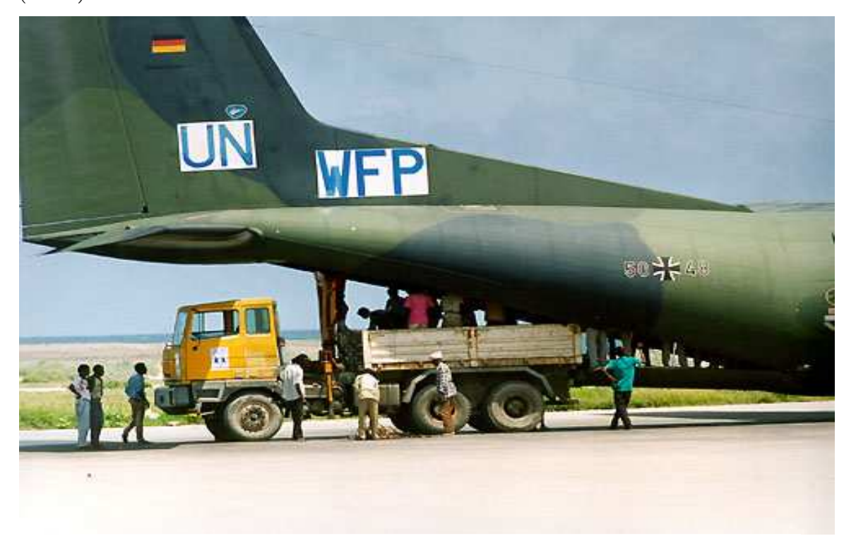
German military airplane at the Mogadishu-Airport, 9. September 1992

Somalia, UNOSOM, for humanitarian support. Germany supported this mission with Transport planes. (Photo)