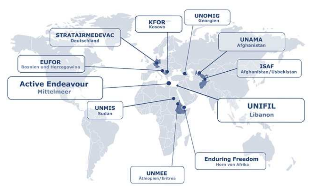
Current out-of-area missions with German participation

This quotation from former German Minister of Defence, Peter Struck, implies a fundamental shift in the German security orientation after 1990. Since the unification, Bundeswehr activity has been constantly expanding around the globe. 1992 in Somalia, 1995 in Bosnia, 1999 the Kosovo-war or 2001 Afghanistan<sup>2</sup>; whether fighting, observing or reconstructing: it seems the ambit of German military engagement is now unlimited. In 2008, nearly 7,000 German soldiers are participating in several out-of-area military operations.<sup>3</sup>